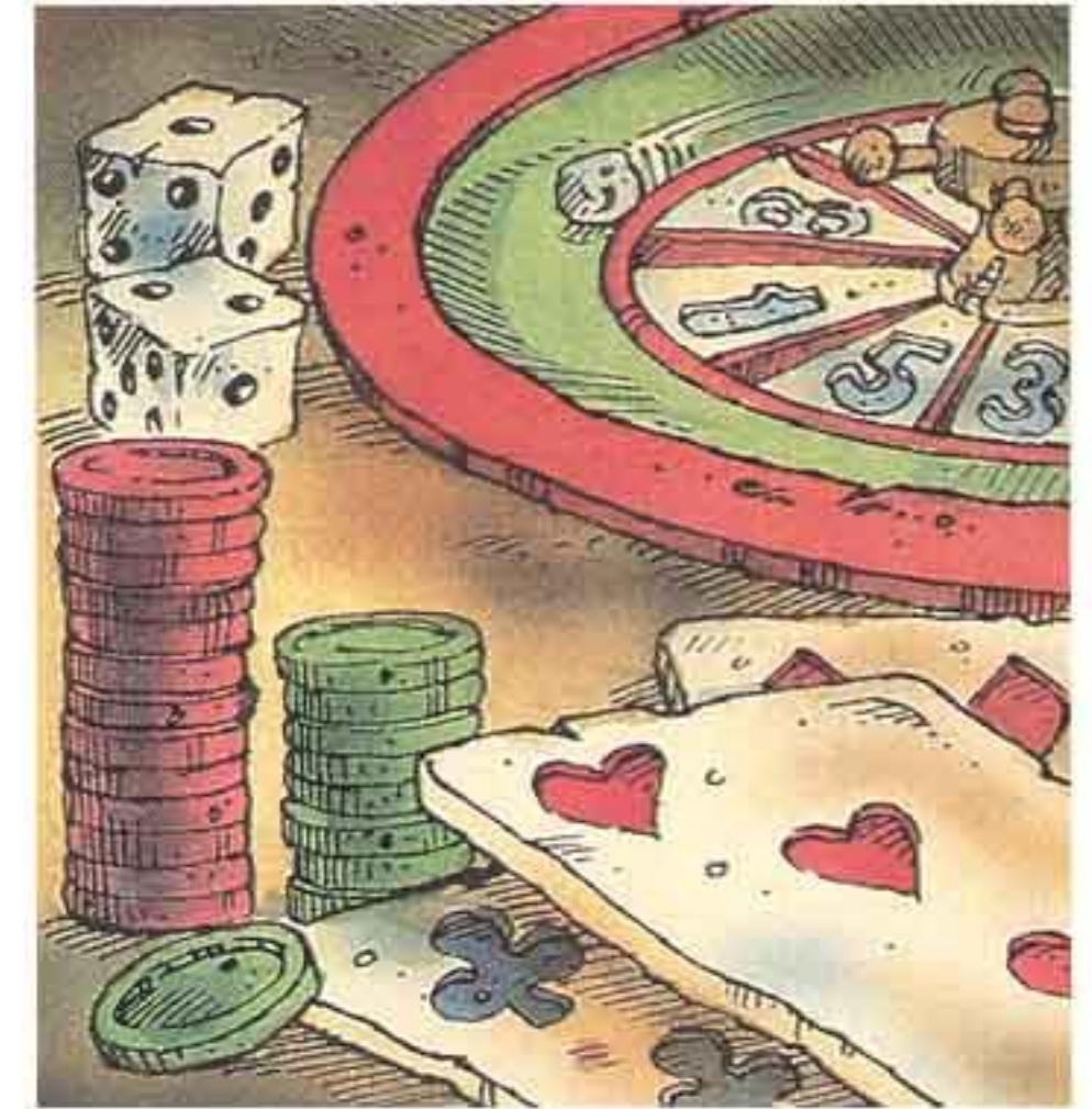
THE BOZBARLAND CASINO: Name your favorite game of chance and we've got it. Roulette, double fan-nuci, burfle, blackjack and more! You'll have the time of your life and maybe walk out with a million zorkmids!