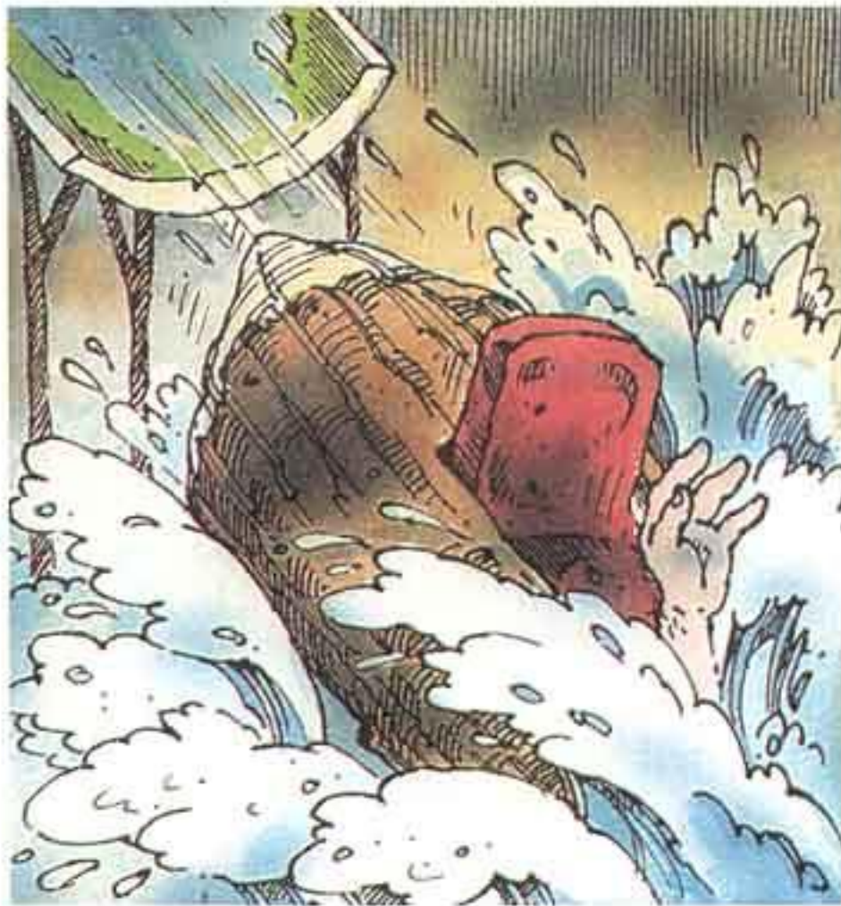
THE FLUME: This splash-filled log boat ride is the largest of its kind anywhere in the world. You'll never trust a water vehicle again!

Bozbarland is just a short trip away, at the western end of the Great Underground Highway. Admission is just one zorkmid, all year round! And be sure to take in Bozbarland's many neighboring sights, the highlight being ancient Egreth Castle, the home of old King Duncanthrax. Make sure your vacation includes a stop at Bozbarland!