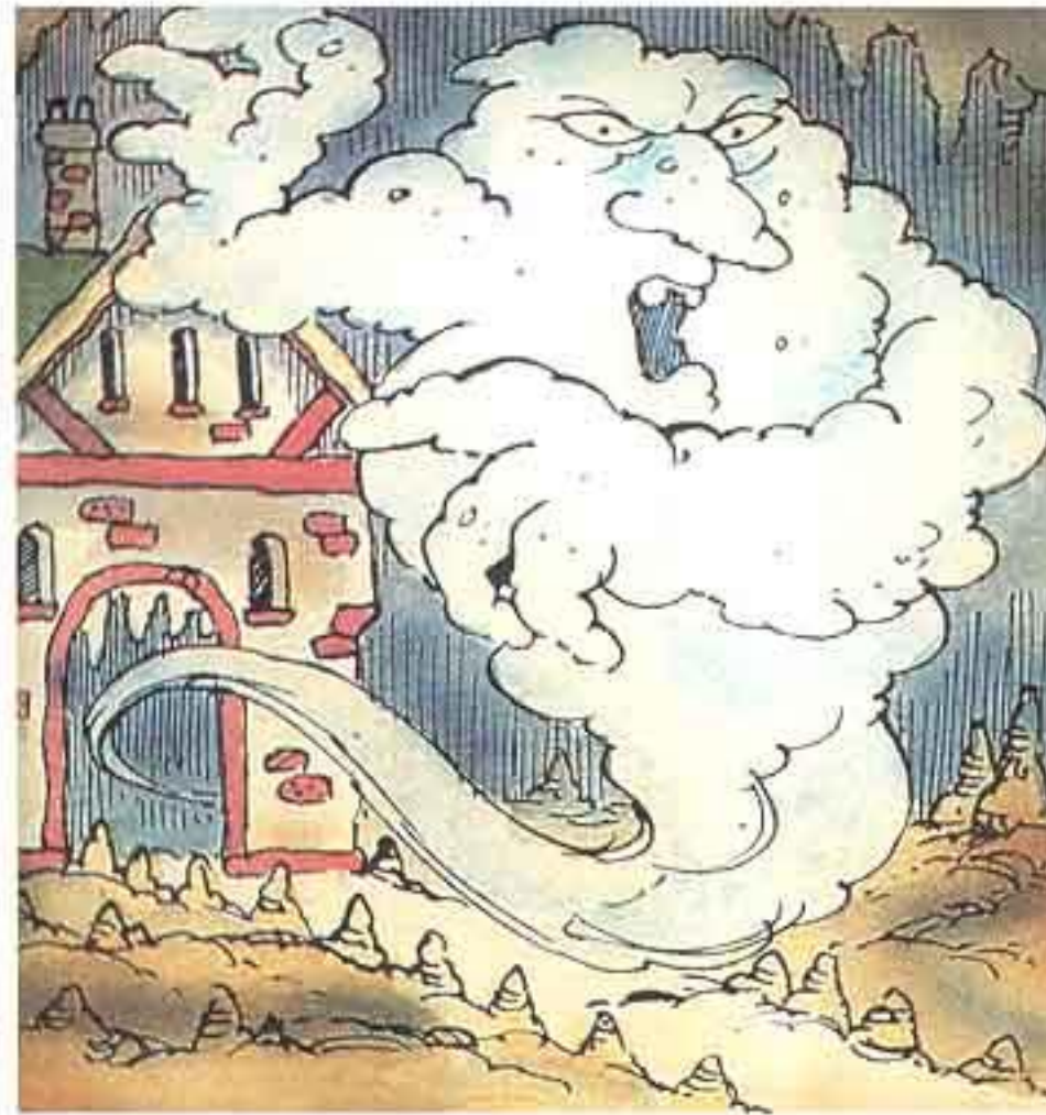
THE HAUNTED HOUSE: The only authentic haunted house you'll ever visit. We've imported ghosts, goblins, spooks, spirits and apparitions from all over the Kingdom. You'll never forget your walk through the Haunted House . . . IF you get out alive!