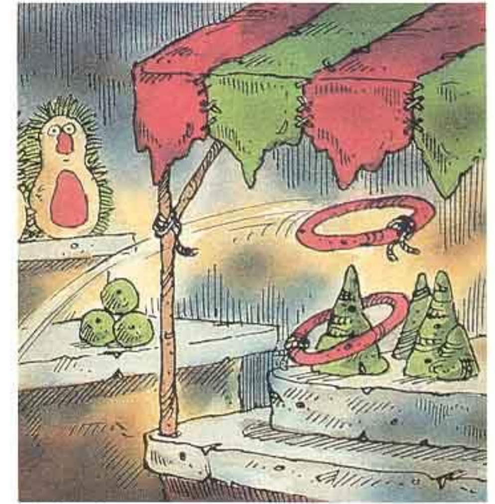
MIDWAY: Where else can you find almost a square bloit filled with games of chance and skill? And refreshment stands that sell cotton candy, dragon burgers and fried glurz?