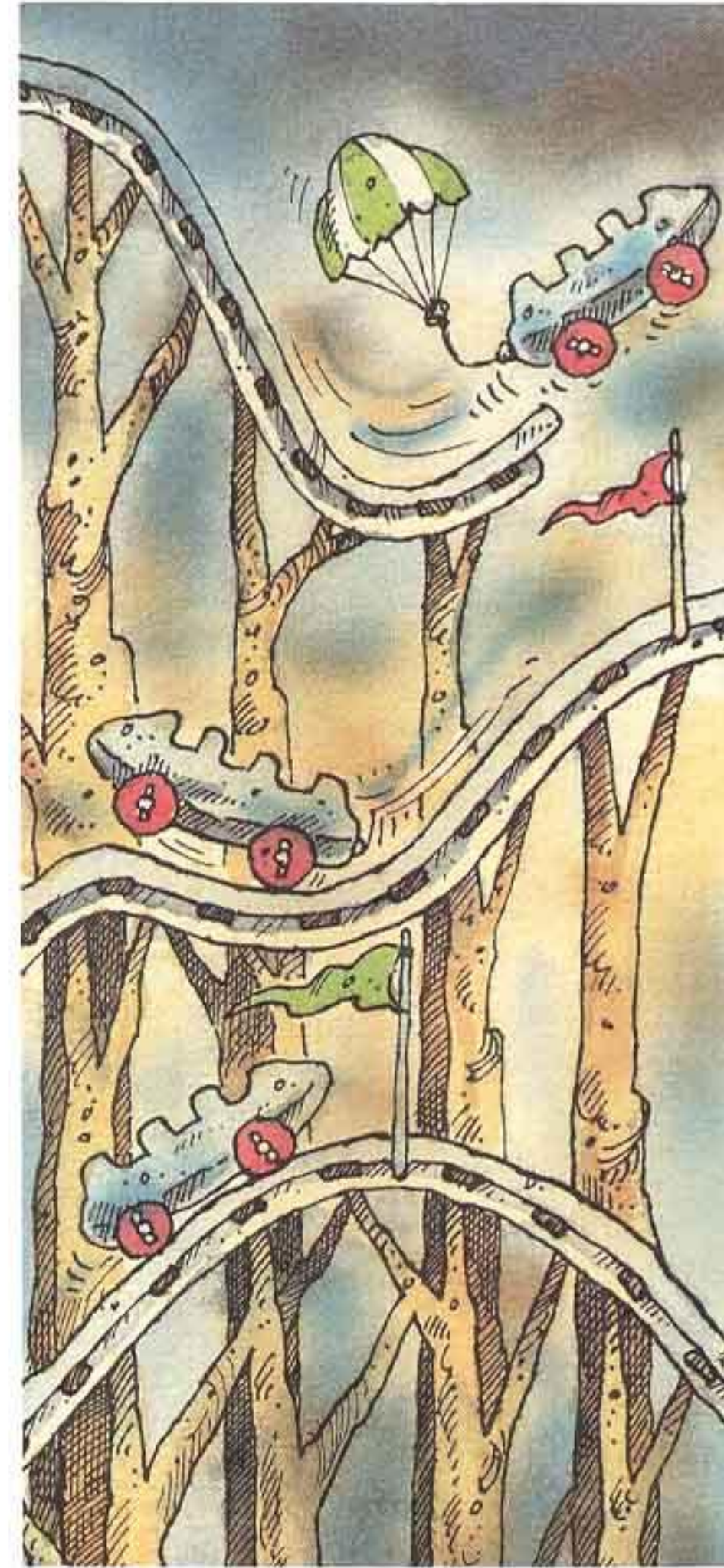
THE ROLLER COASTER: Hold onto your glorbs! You'll travel faster than you've ever travelled before. Magic and engineering combine to create the most thrilling experience imaginable!